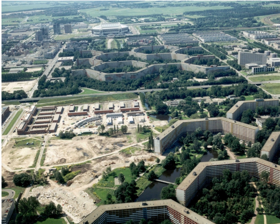
Ill. 1 Aerial photo of Bijlmermeer

During the implementation of the General Extension Plan (GEP) it was already clear that it would not meet the strong growth in housing demand after 1950. New opportunities for expansion were sought. These were found in the north and southeast of Amsterdam, areas dropped by the GEP. Since original objections (problems concerning accessibility and municipal boundaries) could be overcome, plans were developed to house some 100,000 residents in each area. For south-eastern Amsterdam, the Bijlmermeer was first designed and built according