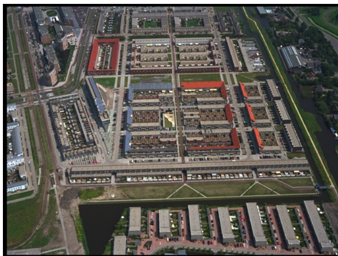
Ill. 3 Aerial photo of Nieuw Sloten

Nieuw Sloten, a new residential area with 5000 homes (where 13,000 residents are currently living) in the southwest of Amsterdam, was completed in 1997. On the north and west sides, the area connects with the existing post-war western suburbs. The old village of Sloten lies to the southwest and on the southern side there are areas for recreational purposes.